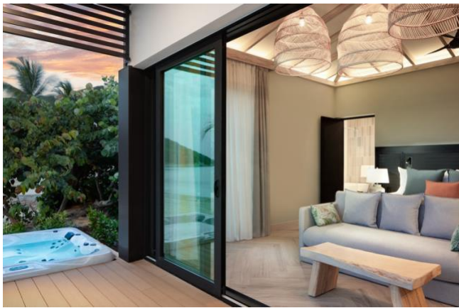
Beachfront Room with Hot Tub, Peter Island Resort