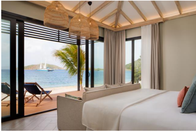
Beachfront One Bedroom, Peter Island Resort