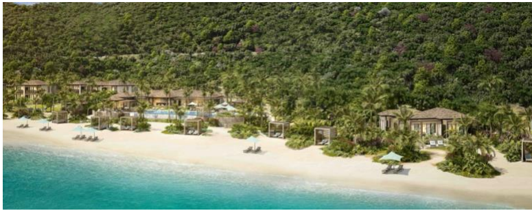
Deadman's Beach, Peter Island Resort