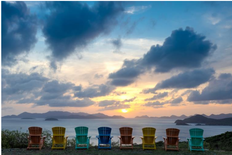
Sunset Loop, Peter Island Resort